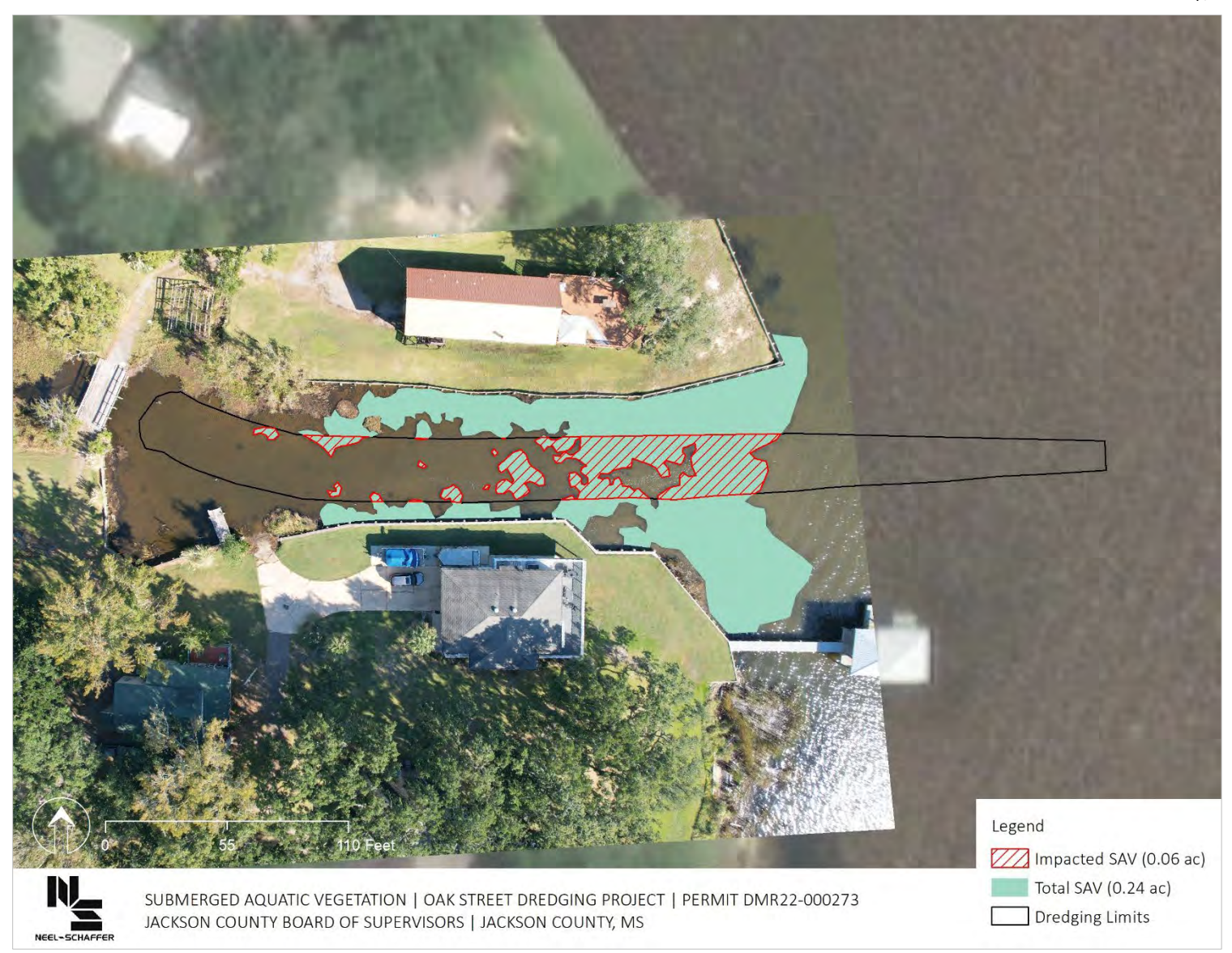
Figure 2: Mapped Submerged Aquatic Vegetation within Oak Street Bayou

SAM-2022-00474-PAH Oak Street Bayou Maintenance Dredging Project Jackson County, Mississippi