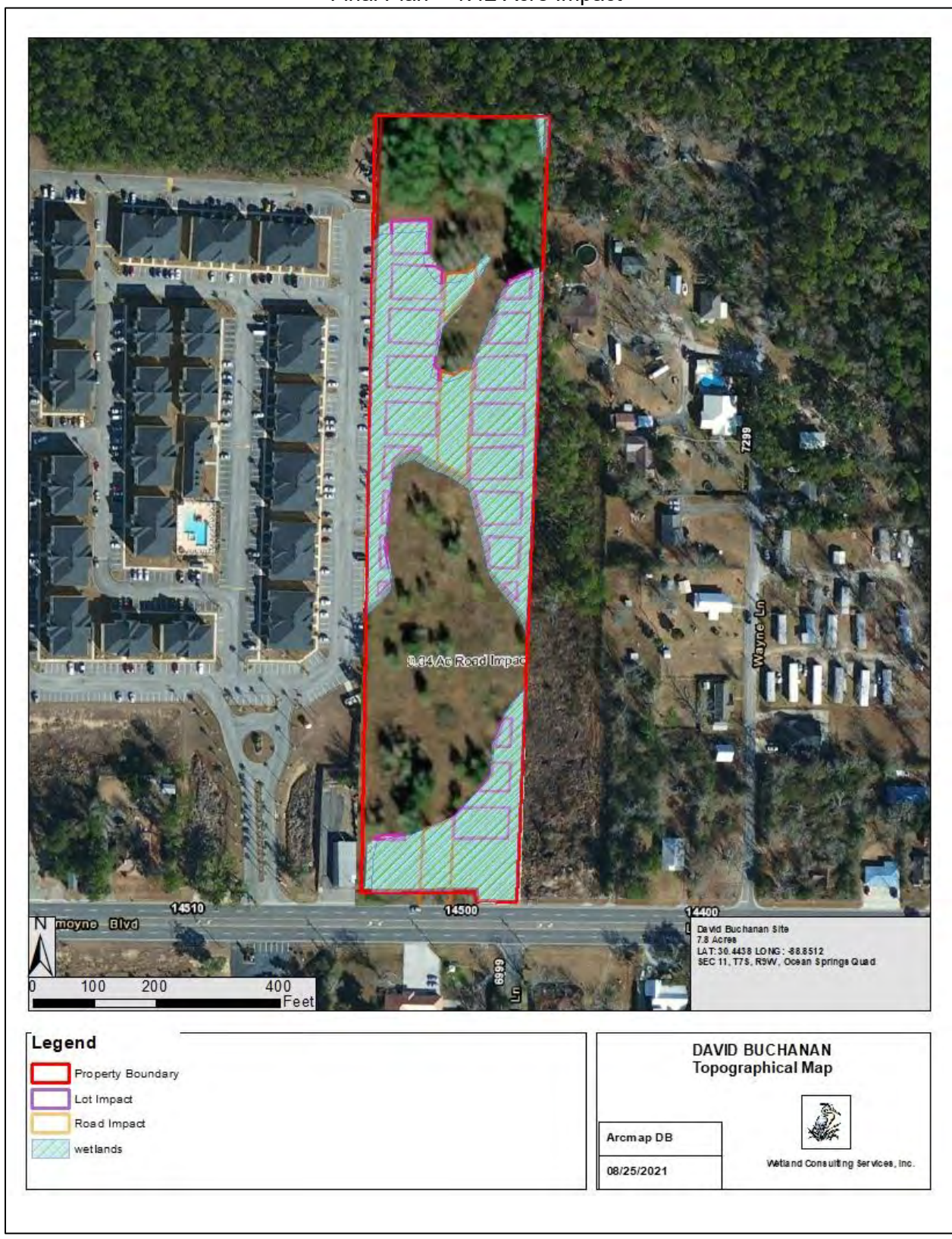
Final Plan – 1.42 Acre Impact