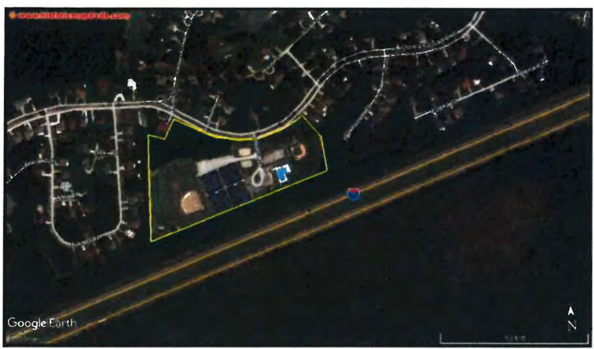
Site Perimeter Aerial