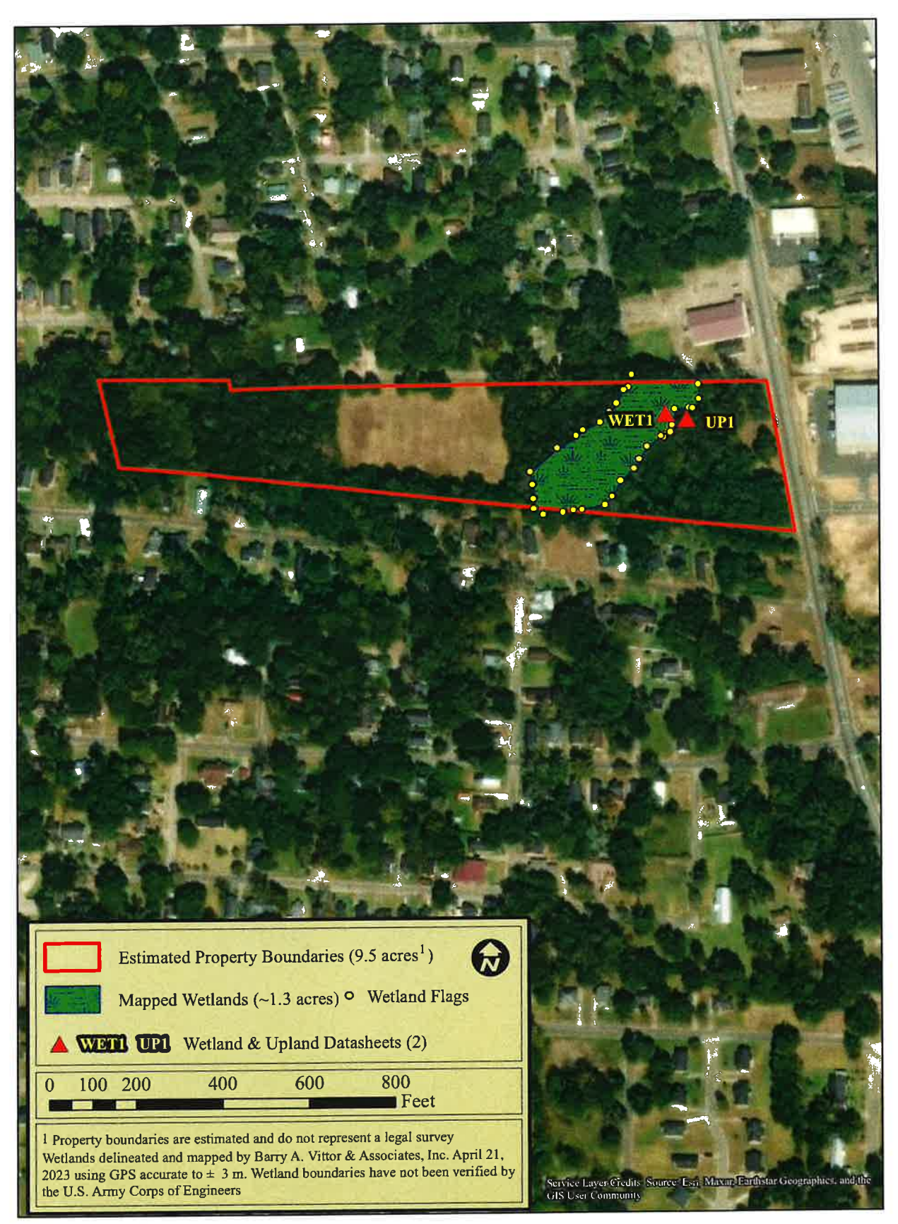
Figure 3. Wetland Map (April 24, 2023)