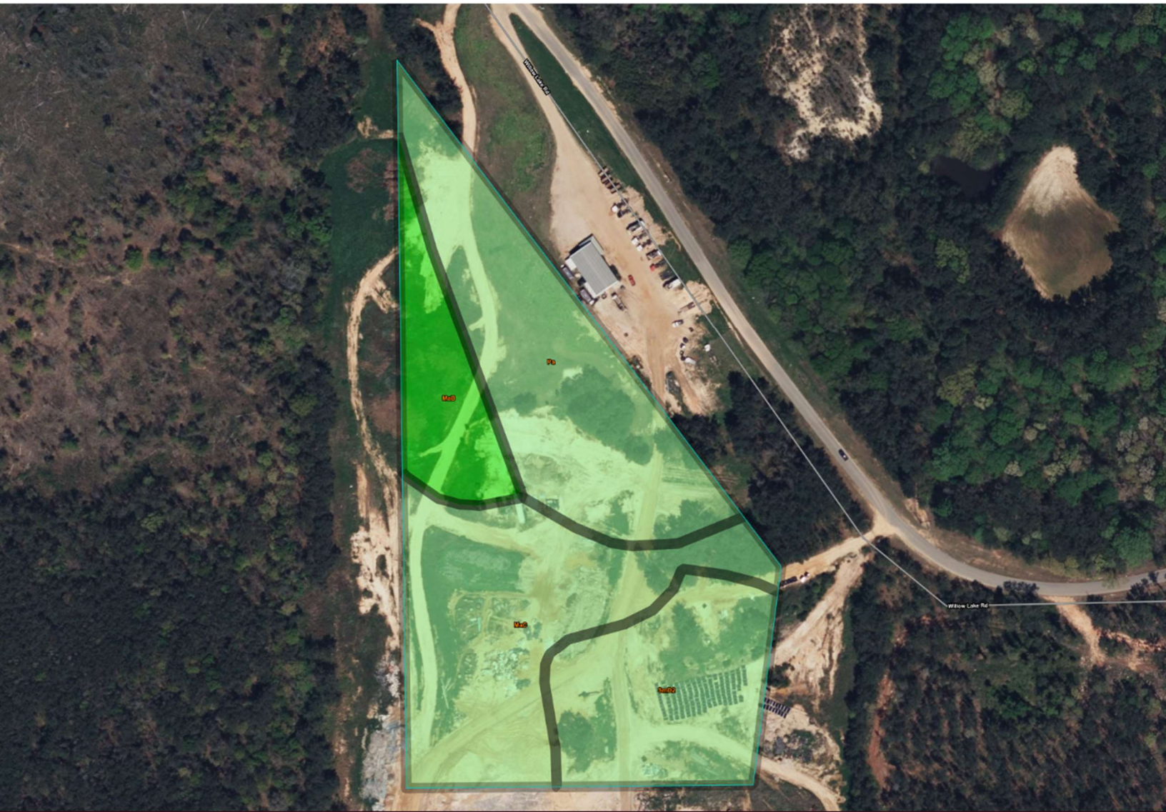
Figure 5 NRCS Soil Survey

SUBJECT: Pre-2015 Regulatory Regime Approved Jurisdictional Determination in Light of Sackett v. EPA , 143 S. Ct. 1322 (2023), SAM-2020-1187-LET