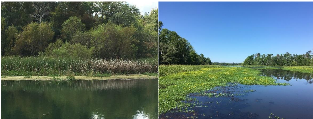
Figure 2: Aquatic Weeds on Lake Seminole FL/GA

Depending on the season, many areas of the lake are impacted by nuisance growths of floating, emergent, and submerged aquatic vegetation. The aquatic vegetation impacting the lake is Hydrilla ( Hydrilla verticillata ), Water Hyacinth ( Eichhornia crassipes ), Variable-leaf Watermilfoil ( Myriophyllum heterophyllum ), Eurasian Watermilfoil ( Myriophyllum spicatum ), Giant cutgrass ( Zizaniopsis miliacea ), Common Reed ( Phragmites australis ), Cuban Bulrush ( Oxycaryum cubense ), Alligatorweed ( Alternanthera philoxeroides ), Fanwort ( Cabomba caroliniana ), Asian Marshweed, East Indian Hygrophila ( Hygrophila polysperma ), American lotus ( Nelumbo lutea ), Common Salvinia ( Salvinia minima ), pondweed species ( Potamogeton sp), cattail species ( Typha sp), and water primrose species ( Ludwigia sp). Algae species may be targeted in the future should they develop to nuisance levels. The total combined surface acreage of the lake is 37,500 Acres. In recent years past, as much as 60% of the lake has been impacted with aquatic vegetation growth. Lake Seminole drains into the Apalachicola River below the Jim Woodruff Lock and Dam.