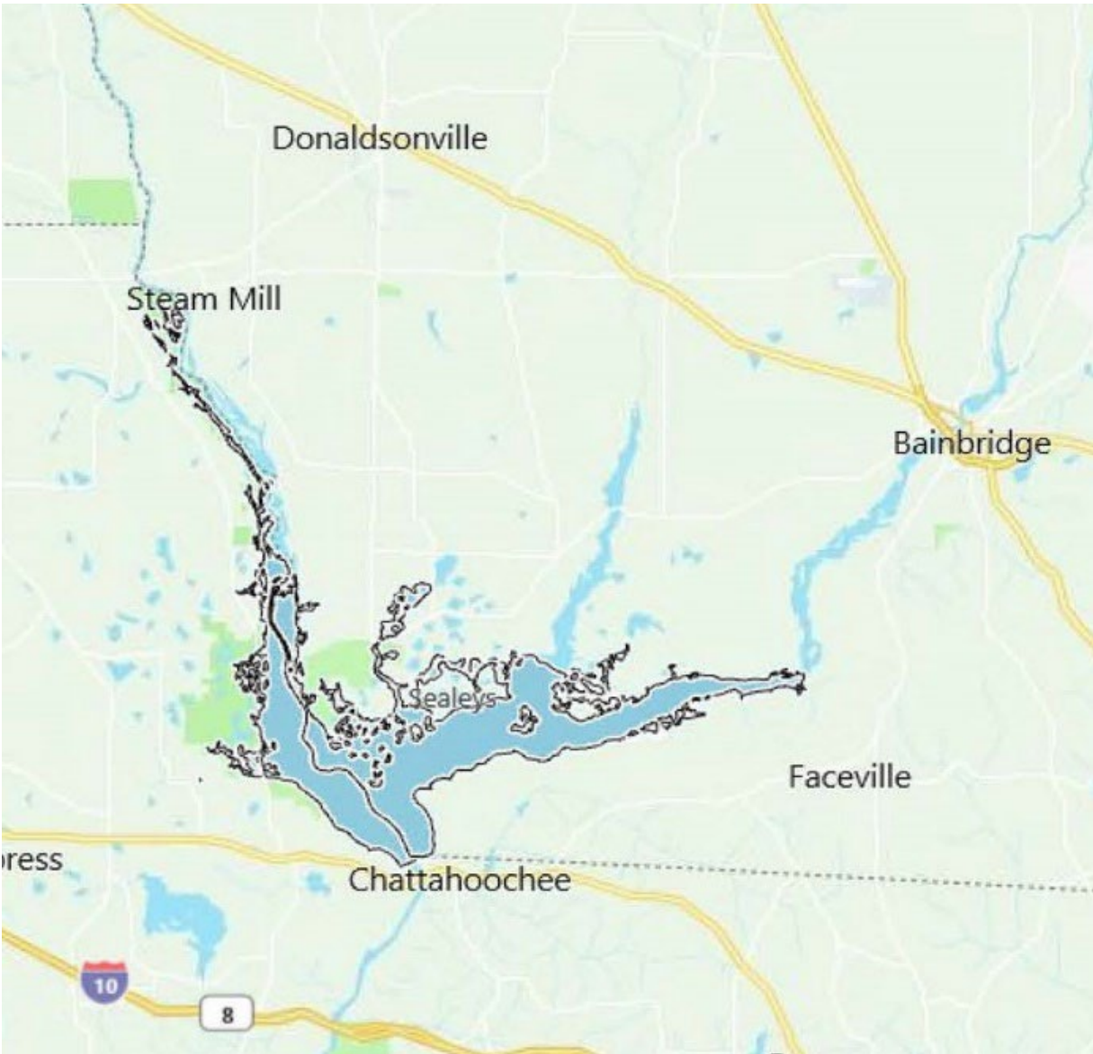
Figure 1: Geographical extent of Lake Seminole GA-FL