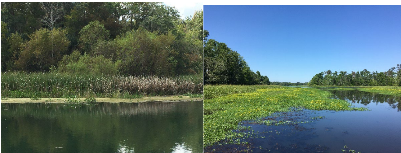
Figure 2: Aquatic Weeds on Lake Seminole FL/GA

blepharoleptos ), Alligatorweed ( Alternanthera philoxeroides ), Fanwort ( Cabomba caroliniana ), Asian Marshweed ( Limnophila sessiliflora ), East Indian Hygrophila ( Hygrophila polysperma ), American lotus ( Nelumbo lutea ), Torpedograss ( Panicum repens ), Common Salvinia ( Salvinia minima ), pondweed species ( Potamogeton sp), cattail species ( Typha sp), and water primrose species ( Ludwigia sp). Other species may be introduced in the future, which will be a priority to prevent establishment. Species of particular concern for introduction are Crested floating heart ( Nymphoides hydrophylla ) and Giant salvinia ( Salvinia molesta ). Algae species may be targeted in the future should they develop to nuisance levels. The total combined surface acreage of the lake is 37,500 Acres. As much as 60% of the lake at times has been impacted with aquatic vegetation growth.