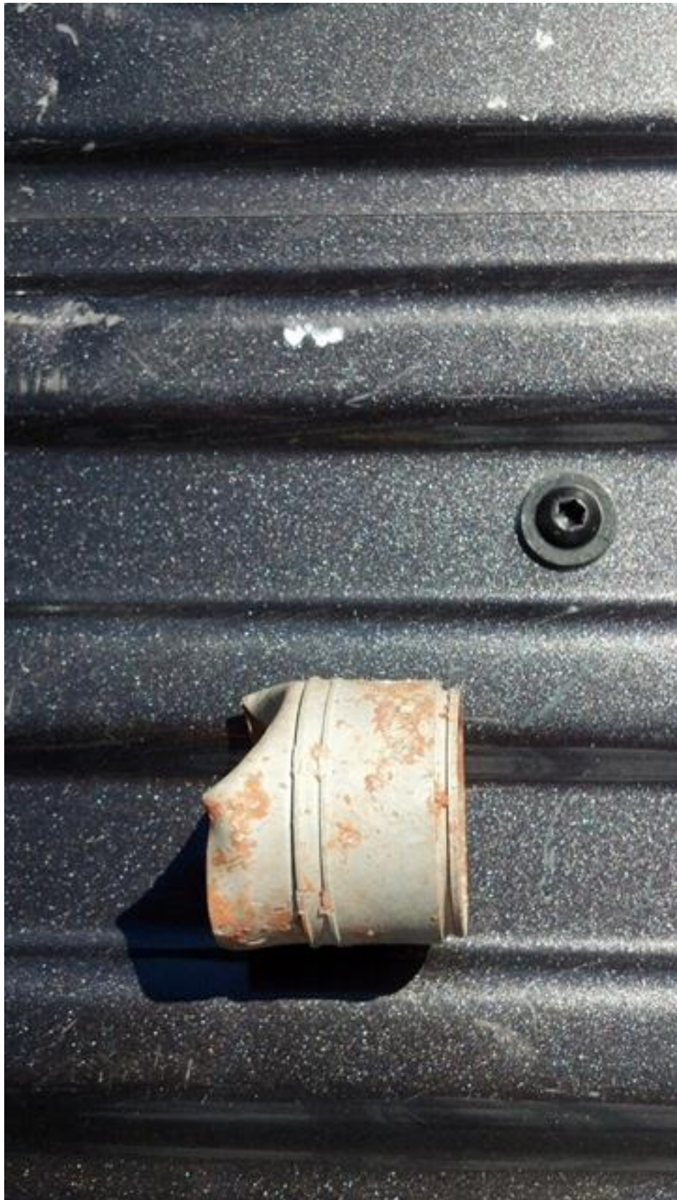
Expended 40mm Cartridge case