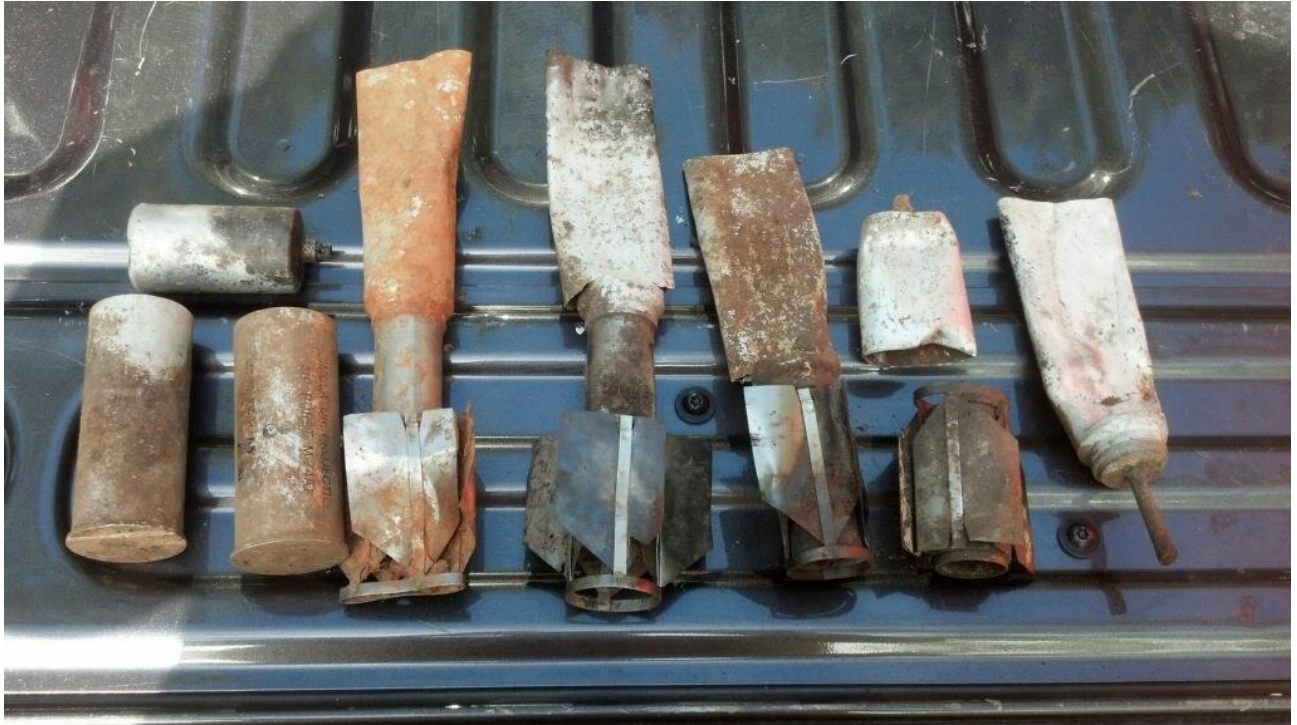
Expended Signal, Illumination, Ground (Slap Flare) components