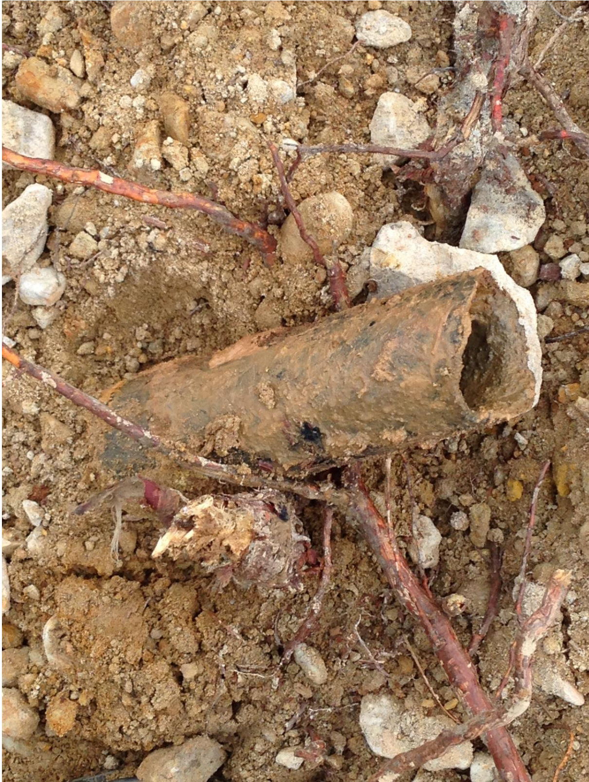
Expended MK 1, 75mm Shrapnel Projectile