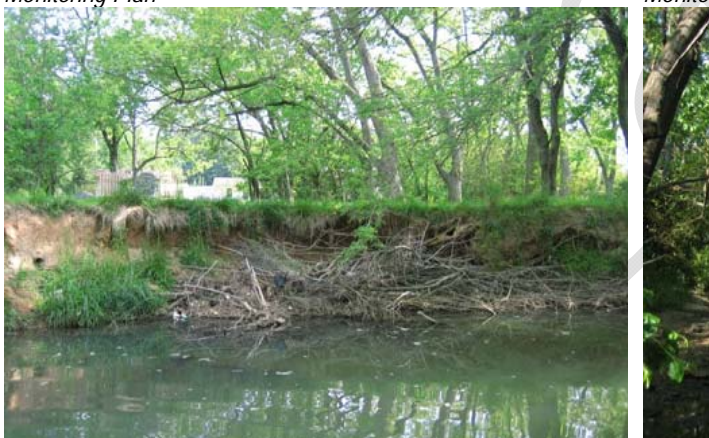
FIGURE 2-3 Station FC-33 Flat Creek Watershed Aquatic Ecosystem Restoration Monitoring Plan

FIGURE 2-2 Station FC-32 Flat Creek Watershed Aquatic Ecosystem Restoration Monitoring Plan